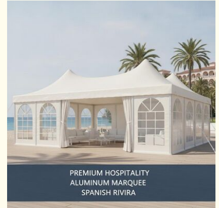
PREMIUM HOSPITALITY ALUMINUM MARQUEE SPANISH RIVIRA