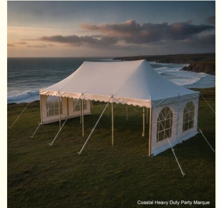
Coastal Heavy Duty Party Marquee