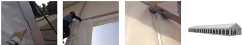
Side Wall Installation