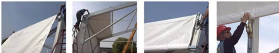
Roof Fabric Installation