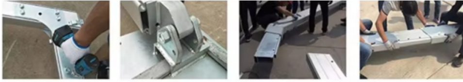
Frame parts connection

The whole frame is connected by the loose knot method of locking screws so it's easy to install and move There are slots on both sides of the aluminum alloy frame to facilitate the passage of strips on the pvc cover There are side buckles on the side wall pvc cover, so we can pull it aside or take it down, there is a zipper in the middle of each side wall cover, when it is closed, it can be used as wall, conversely, it will be used as door