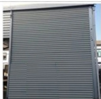
Roller Shutter Door