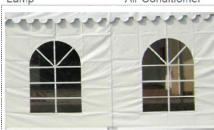
Clear PVC Windows