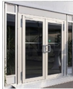
Double Wing Glass Door