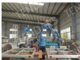
Automatic welding robot machine