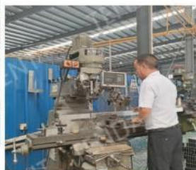
Cutting material machine