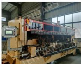
Automatic iron layher machine