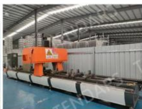
Production tent CNC machine