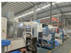
Production accessory CNC machine