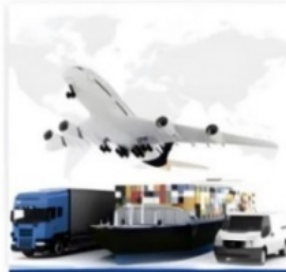
06. Shipping to customer