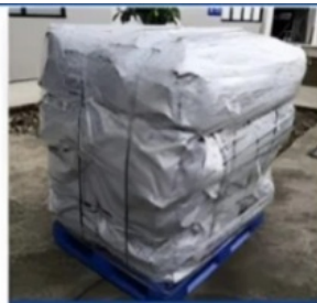
02. Accessories and Fabric in PVC Bags