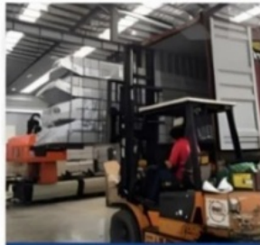
04. Professional loading team