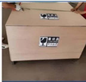
01. Glass Wall in Wooden Box