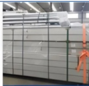
03. Aluminum frame Packed in membrane films