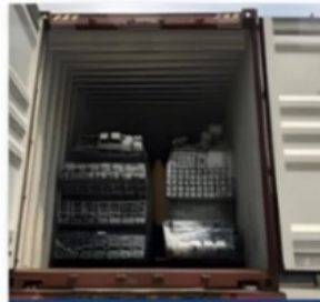
05. Finish Loading