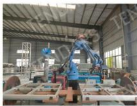
Automatic welding robot machine