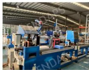
Automatic welding sleeve spigot machine