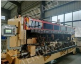
Automatic iron layher machine