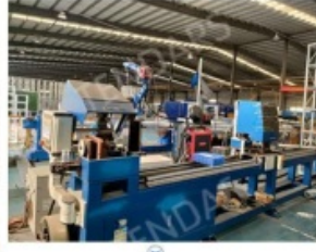
Automatic welding sleeve spigot machine