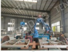
Automatic welding robot machine