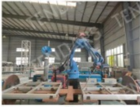
Automatic welding robot machine