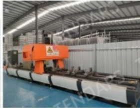
Production tent CNC machine