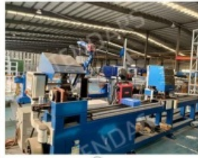
Automatic welding sleeve spigot machine