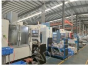
Production accessory CNC machine