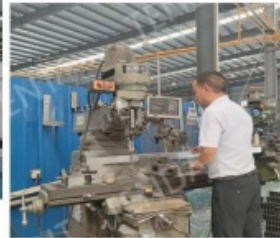
Cutting material machine