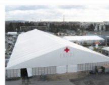
Medical Supplies Storage Tent