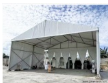
Warehouse Tent for Car Parking Garage