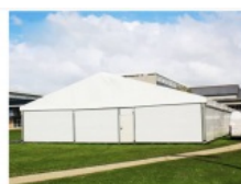
Temporary or Semi-permanent Warehouse Tent