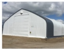
Large Clear Span Warehouse Tent