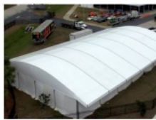
Warehouse Storage Tent