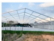
Large Clear Span Warehouse Tent 60mx24m