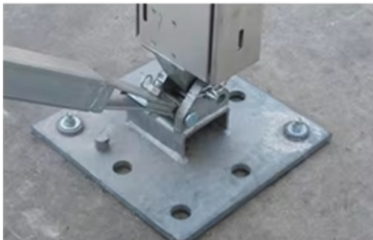
Base Plate Hard and firm