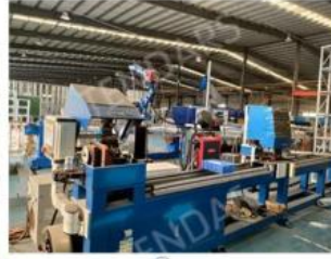
Automatic welding sleeve spigot machine