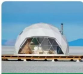
Glamping Dome Tent