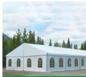
Wedding Party Tent