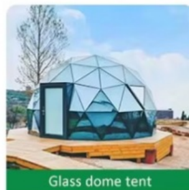
Glass dome tent