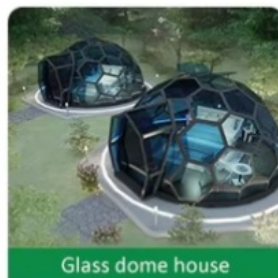
Glass dome house