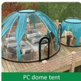
PC dome tent