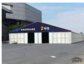
Trade Show Tent