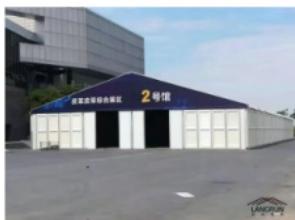
Trade Show Tent