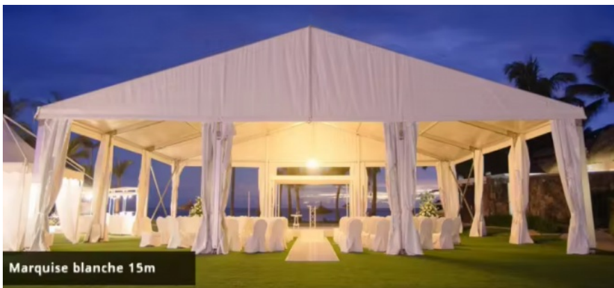
Marquise blanche 15m