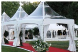
6 X 6 M