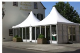
4 X 4 M