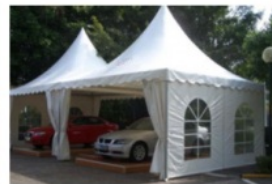
5 X 5 M