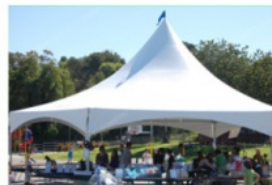
10 X 10 M