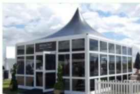
3 X 3 M