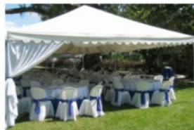
8 X 8 M