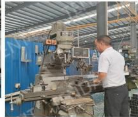
Cutting material machine