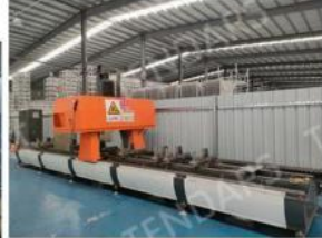
Production tent CNC machine