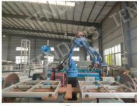
Automatic welding robot machine