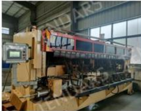
Automatic iron layher machine