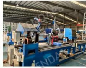
Automatic welding sleeve spigot machine