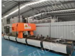
Production tent CNC machine