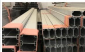
Aluminium main frame