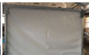
regular PVC tent cover