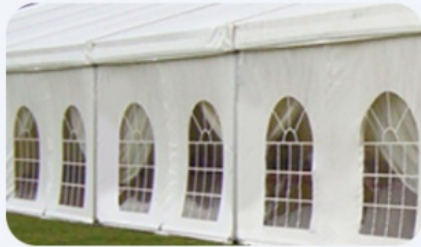
PVC Transparent Window