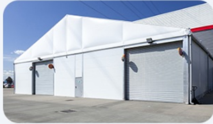
Color Coated Steel Sheets