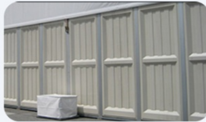
ABS Hard Board