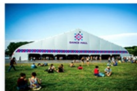
America Party Tent