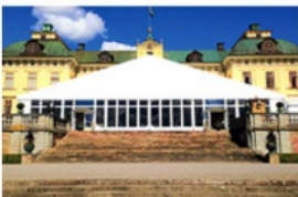
Spain Cocktail Party Tent