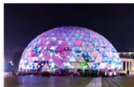
New products conference Tent