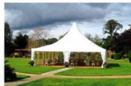
Malaysia Meeting Tent