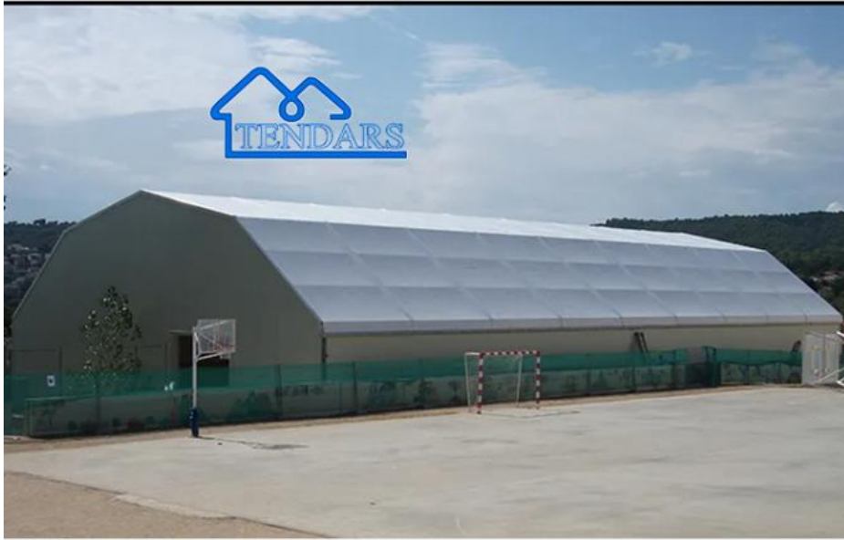
Guangzhou Tendars Tent Co., Limited Phone: 0086 13640286461