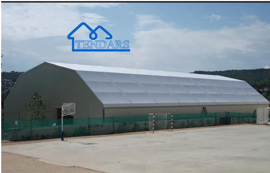
Marquees with 100m x 100m Size 100m x 100m x 10m