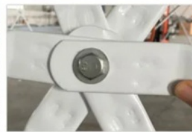
Six sides interface