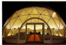
The farm hotel