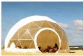
Seaside Resort Hotel