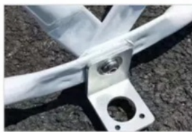
Skeleton foundation fixed interface