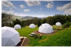
Grassland Scenic Hotel