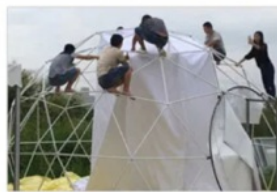
Super strong bearing