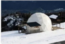
Snow Scenic Resort Hotel