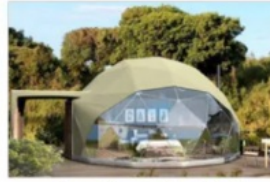
Forest Scenic Spot Hotel