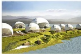
Lakeside Resort Hotel