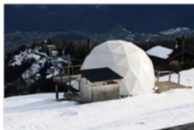
Snow Scenic Resort Hotel