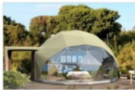
Forest Scenic Spot Hotel