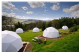
Grassland Scenic Hotel