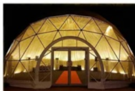
The farm hotel