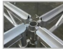
CONNECT OF FOUR STAGES