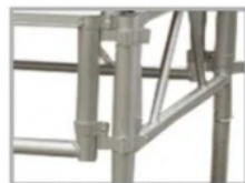
CONNECT OF BRACE AND PILLAR