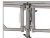
CONNECT OF TWO STAGES