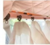
curtain with rail insulation layer