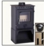
Stove & chimney