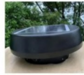
solar exhaust fan