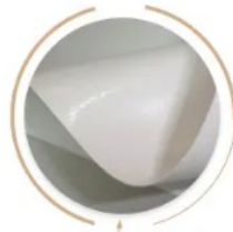
Double Side PVC fabric