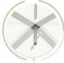
Steel Support Rod