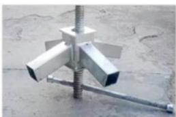
Top adjustment point fitting