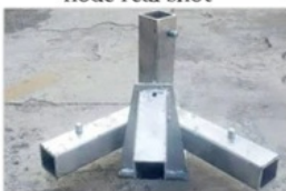
Corner support node fittings