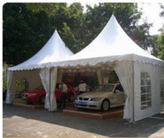
Mobile car show