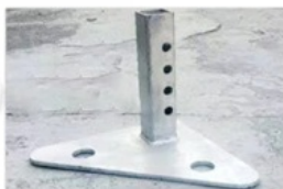
Support column interface base