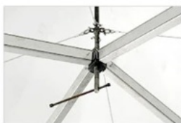
Top adjustment point