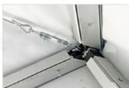
Corner support node real shot