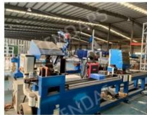
Automatic welding sleeve spigot machine