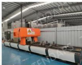
Production tent CNC machine