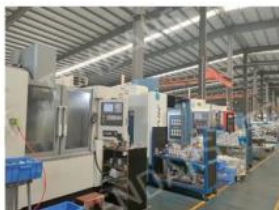
Production accessory CNC machine