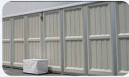
ABS Hard Board