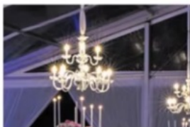
lamps and lanterns