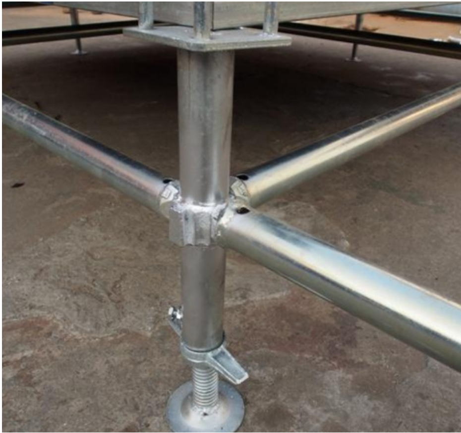
The top support is a part of the aluminum alloy stage plate, also known as the connecting plate.