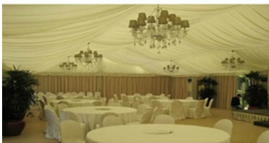
pleated roof lining and curtain