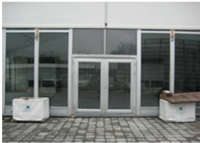
double wing glass door