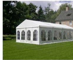
clear pvc windows